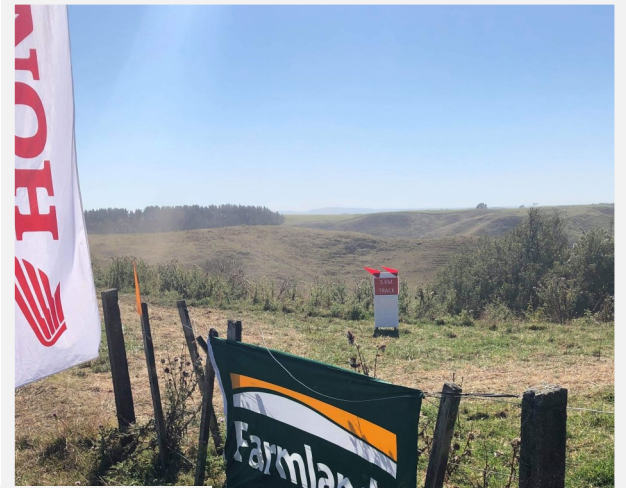
Trail Ride Sponsors.