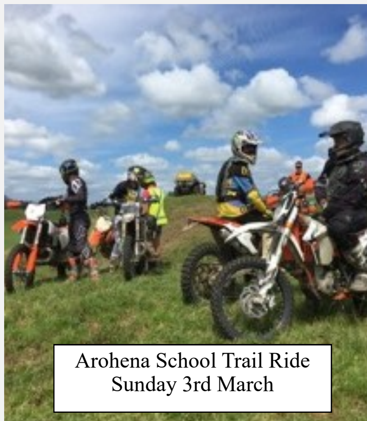
Arohena School Trail Ride Sunday 3rd March